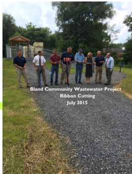
Bland Community Water Project