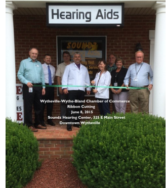
Soundz Hearing Center 325 E. Main St., Wytheville 276.228.5800