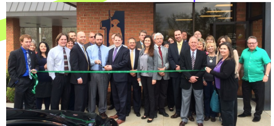
First Sentinel Bank 1105 North 4th St., Wytheville 276.228.1020