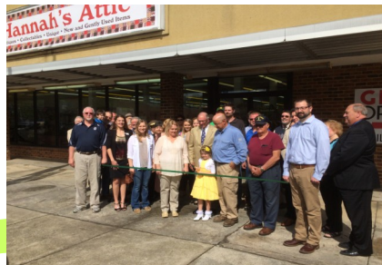
Hannah's Attic 230 W. Main St., Wytheville 276.227.0440