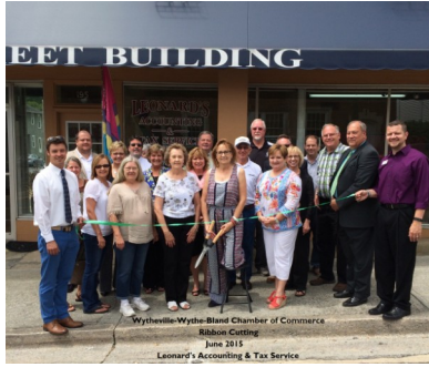
Leonard's Accounting and Tax Service 195 S. 1st St. Suite 102 Wytheville 276.625.0100